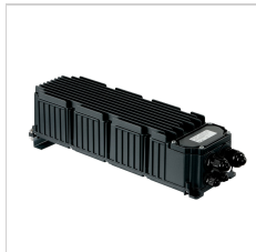
3109424 Driver box 1000 - 1,4 A - 2 CH - DMX